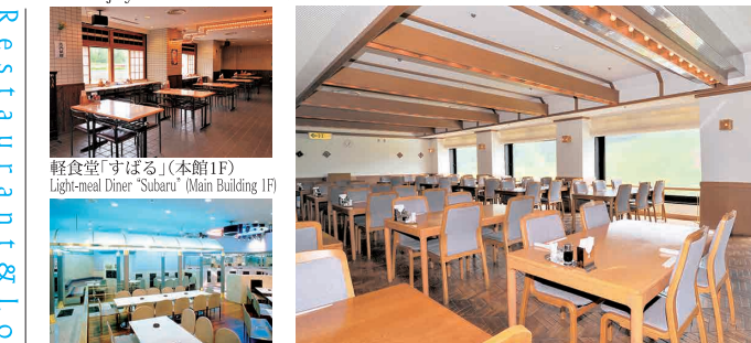
軽食室「すばる」(本館1F) Light-meal Diner "Subaru" (Main Building 1F) レストラン「アポロン」(本館8F) Restaurant "Apollon" (Main Building 8F)

多彩なレストラン・ラウンジ 自然の中で美味しさ満喫 A variety of restaurants, lounges and entertainment facilities complement your full enjoyment of Tsunan and its natural environment