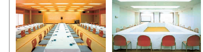
大会議室(本館4F) Large Meeting Room (Main Building 4F)