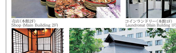
コインランドリー(本館1F) Laundromat (Main Building 1F) 直売所「はいこんちよ」 Farmer's Market "Haikoncho"