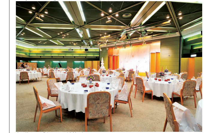
多目的ホール「オーロラ」(本館6F) Multi-purpose "Aurora" (Main Building 6F) 中会議室(本館4F) Medium Meeting Room (Main Building 4F)