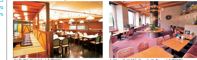
パブ「レインボー」(本館1F) Pub "Rainbow" (Main Building 1F) 和食室「天の川」(本館8F) Japanese Cuisine "Ama-no-gawa" (Main Building 2F)