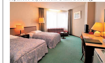
洋室(本館) Western Style Room (Main Building)