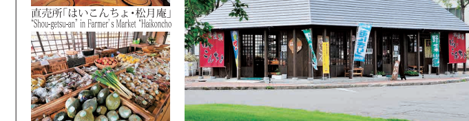
直売所「はいこんちよ」 Farmer's Market "Haikoncho"

爽やかな緑の風が吹き抜けるロケーションでウェディングも人気です。結婚式・披露宴から各種宴会、会議、研修会など用途に応じて様々なご利用いただけます。New Greenpia Tsunan offers a pleasant location for wedding ceremonies. Whatever your wishes and needs for your special day, we are happy to help. We provide all necessary assistance to make MICE (Meeting, Incentive, Convention, Exhibition) events successful.