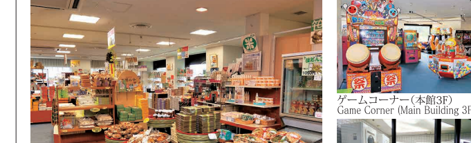
ゲームコーナー(本館3F) Game Corner (Main Building 3F) 売店(本館2F) Shop (Main Building 2F)