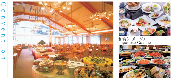
バンケットホール「ペガサス」(東館2F) Banquet Hall "Pegasus" (East Building 2F) 和食(イメージ) Japanese Cuisine Buffet

爽やかなロケーションの中 心に残る思い出を An invigorating setting to make your special event memorable