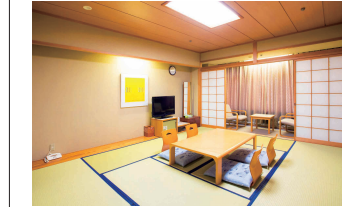
和室(本館) Japanese Style Room (Main Building)