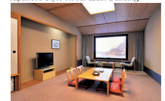
ペットと宿泊可能和室(東館) Pet-Compatible Japanese Style Room (East Building)