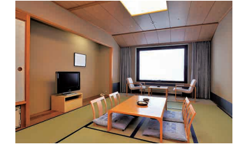
和室(東館) Japanese Style Room (East Building)