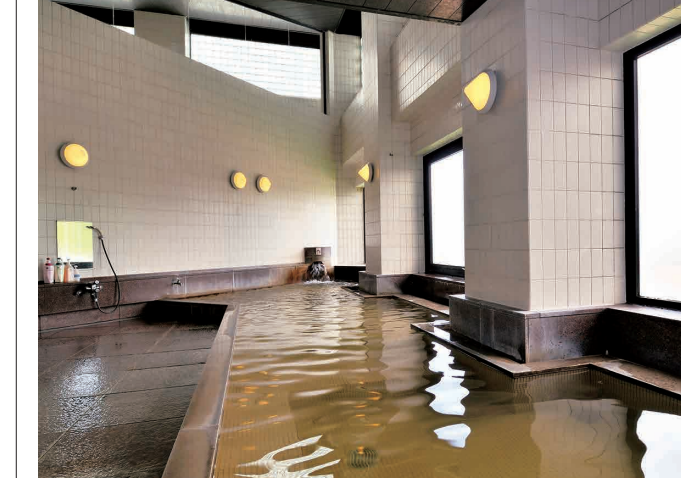
大浴場(本館3F) Indoor Bath (Main Building 3F)

旬の味わい、津南ならではの食材を堪能していただくレストランで、料理長が職を振るう料理をお楽しみください。各種お土産品などを取り揃えた売店やゲームコーナー、ランドリーコーナーなど館内で快適にお過ごしいただける設備が充実しています。Our chefs work hard to prepare enjoyable meals with seasonal dishes and special ingredients available only in Tsunan. Our stores offer a wide selection of items both to help you enjoy your time at the resort and to take home special seasonal items as souvenirs. Facilities like the game center and the laundromat also serve to make your stay more enjoyable and comfortable.