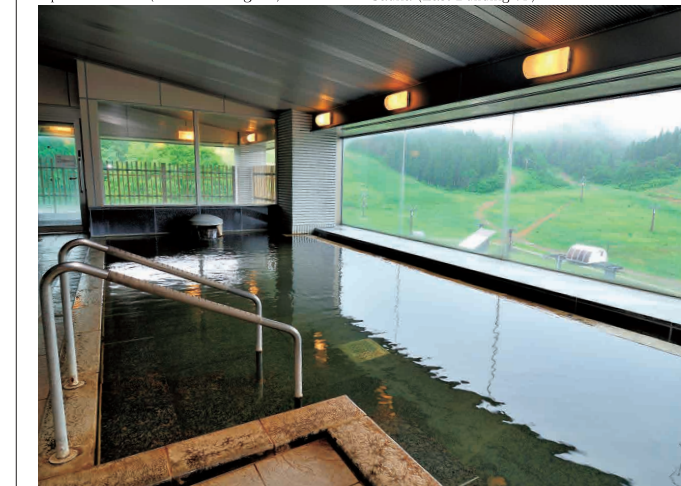
展望温泉大浴場(東館7F) Large Panoramic Hot Spring Bath (East Building 7F)