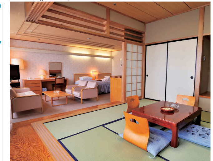
和洋室(本館) Japanese-Western Dual Style Room (Main Building)

大自然に囲まれた上質空間 爽やかなリゾートライフ A luxurious atmosphere surrounded by glorious nature A refreshing resort experience