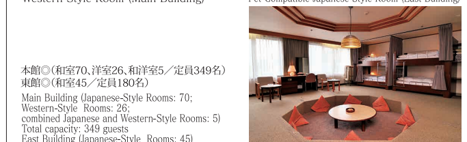
GBルーム(本館) Group Bedroom (Main Building)

本館○(和室70、洋室26、和洋室5/定員349名) 東館○(和室45/定員180名) Main Building (Japanese-Style Rooms: 70; Western-Style Rooms: 26; combined Japanese and Western-Style Rooms: 5) Total capacity: 349 guests East Building (Japanese-Style Rooms: 45) Total capacity: 180 guests